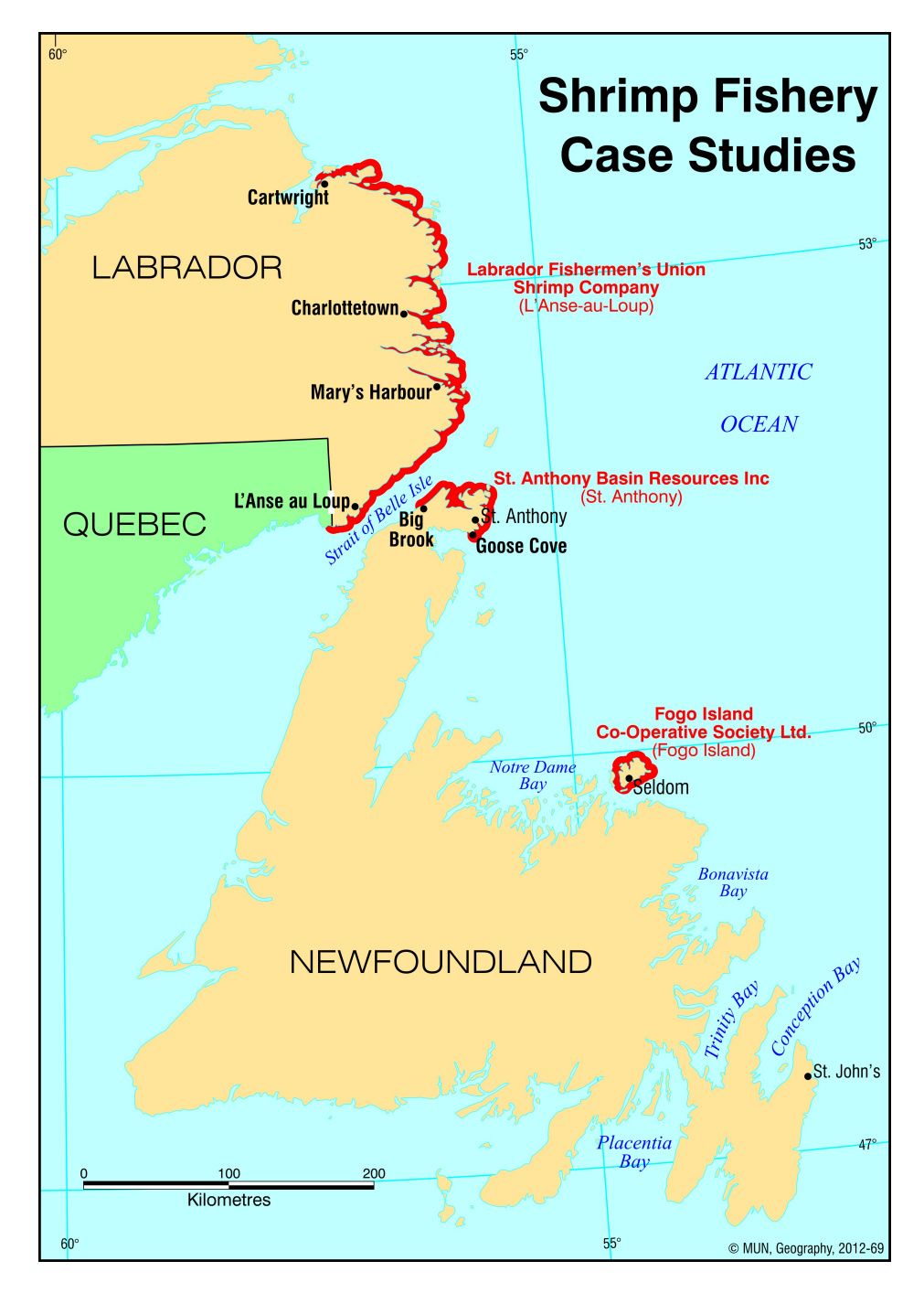
Figure 1: Shrimp fishery case studies