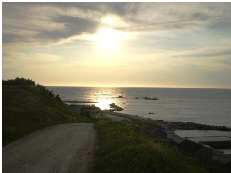
Old House Rocks

Iconic fishing activities such as jigging cod, building boats and building and hauling lobster pots have potential to attract people looking for cultural experiences.