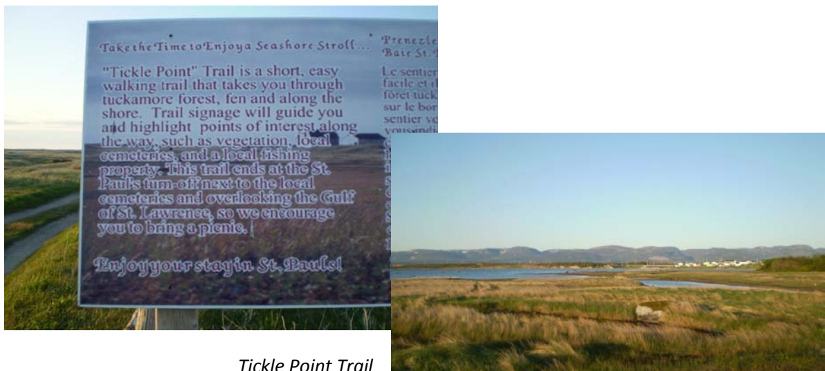
Tickle Point Trail

Tickle Point is an ideal location for an interpretive ecological or heritage program. A simple, self-guided tour could be developed with the use of interpretive signage and information pamphlets. A trail linking the Gros Morne Resort to the dock area/pull-off site would be another valuable link.