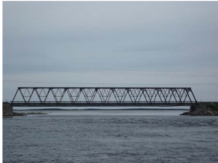
Route 430 bridge over St. Paul's Inlet

The town has well-established partnerships and potential for new partnerships that will continue to be valuable resources for community development in the future.