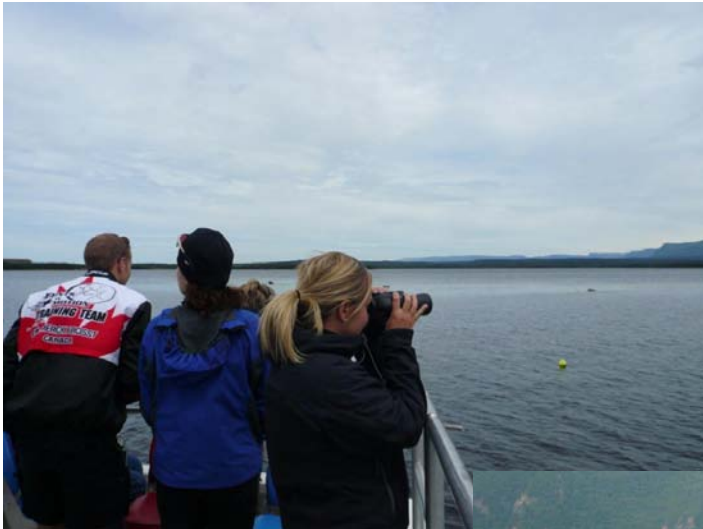
The Seal Island Boat Tour allows views of spectacular scenery and wildlife such as harbour seals.

Seal Island Boat Tours ( http://www.bontours.ca/thetours/seal.html ) in St. Paul's is easy to access and provides an opportunity to view some of the most spectacular scenery and visible wildlife in the region. Many of St. Paul's best scenic attractions are only accessible by boat. Boat tour operators are possible partners for developing future interpretive programs and tourism packages in the community.